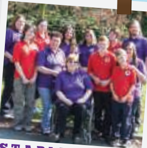
S.T.A.B.L.E., 10 to 55 years old Shropshire, UK

Get the facts on epilepsy and apply to become an Ambassador of Purple in your region.